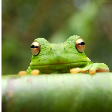
Figura 1: This frog was uploaded to writeLaTeX via the project menu.